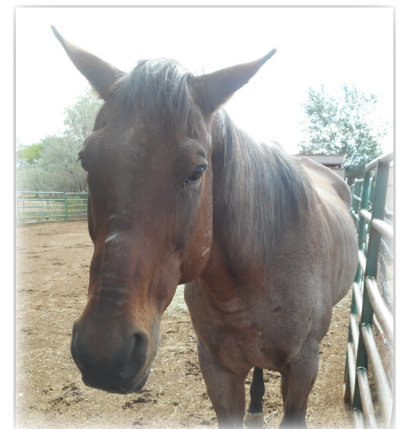
Our newest rescue, a retired roping horse. Life has not been kind to this sweet gelding. He has a dent in his face and scars on his nose, but he has a wonderful disposition, trusting and kind. In just a few short months at ESS he has filled out to close to a normal weight and he has won the hearts of all who work with him.