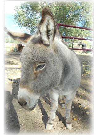
Bindy, our sweet little mascot and hard working therapy donkey