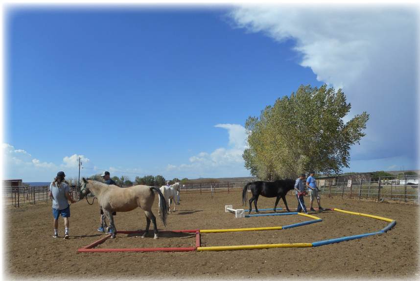
An equine-assisted learning and therapy class, learning to lead the horses through a series of obstacles. It's all about teamwork and communication!

Well-being occurs when we seek and find our unique place in the universe and experience the continuous cycle of receiving and giving through respect and reverence for the beauty of all living things.