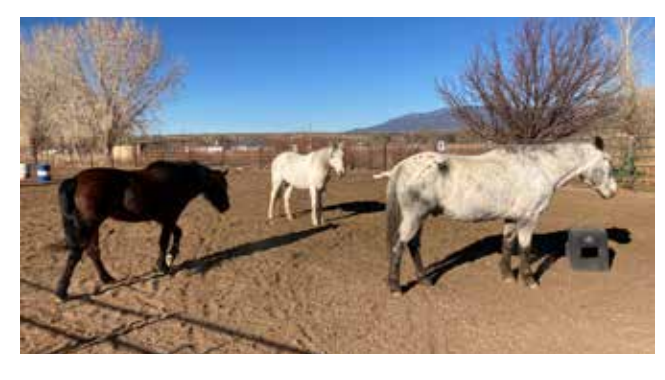
Tango Belle, Maggie and Frosty getting to be friends in the arena.

• Programs: We had 14 kids that participated in the regular riding lesson program and 10 that took therapeutic riding lessons and did the Read to the Donkeys program. We had volunteer practice sessions with our Yoga and Riding program.