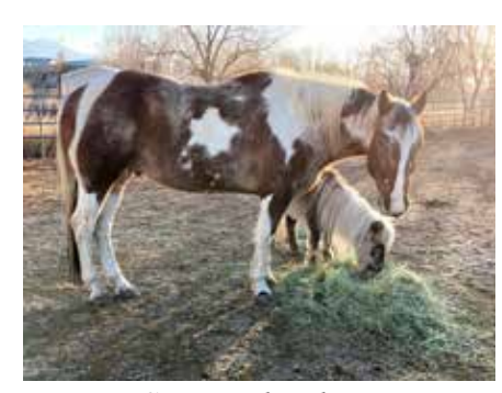
Scout and Dulcy.