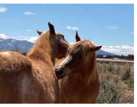
Enjoying the good life at ESS!