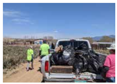
We picked up lots of trash!