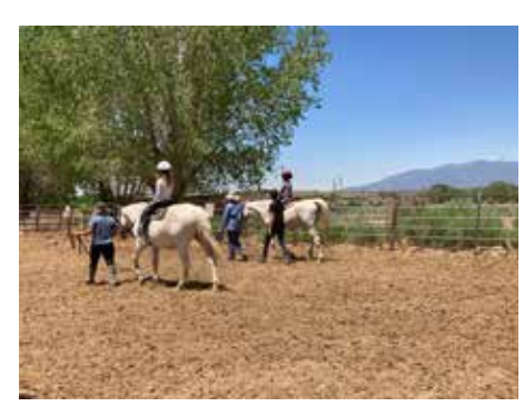
Spirit, above left, and Kat, right, made a great pair for kids' lead line lessons.

Poncho, below, benefits a lot from the Masterson Method® bodywork and enjoys having the volunteers give him lots of extra attention.