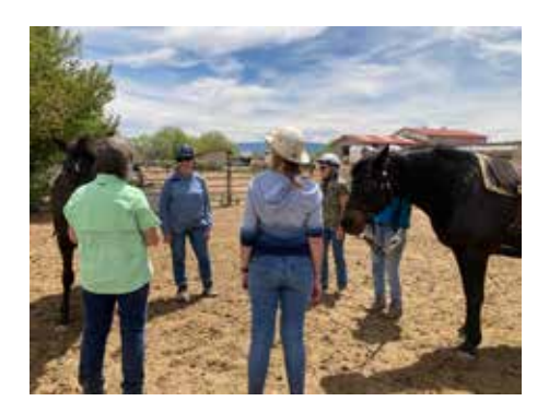
We had volunteer practice sessions with our Yoga and Riding program. Yoga and horses are a great combination! Poncho was a favorite mount for the riding exercises.

• And after years of needing a new wheelchair ramp, we finally were able to raise the funds and purchase a nice aluminum ramp. But, due to COVID delays with construction and delivery, the ramp that we purchased in early summer did not actually arrive at ESS until October, as we were at the end of our season's lessons. But we are looking forward to using it in 2022!