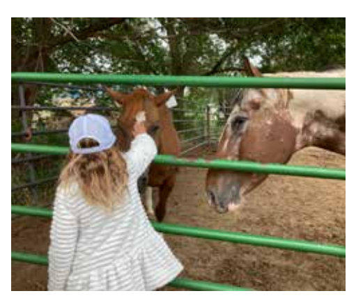
It was wonderful having visitors again in 2021. The horses especially loved having the kids back.