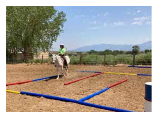
Klassy Kat was our hardest working kids' lesson horse. Jazzy, the donkey, supervised whenever she could!