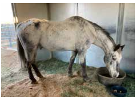
Frosty was in pretty bad shape when he came to ESS but after getting much needed dental care and a new diet of mash, he gained weight quickly and now is doing great.