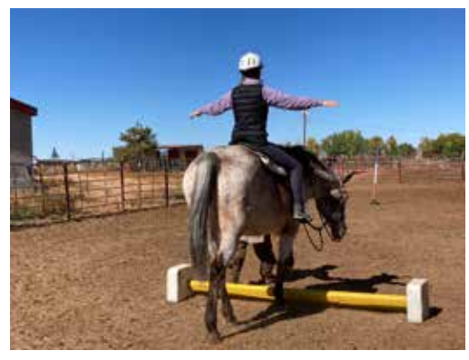
Melvin is a delightful horse with good manners. She enjoys getting lots of attention and being part of our programs.