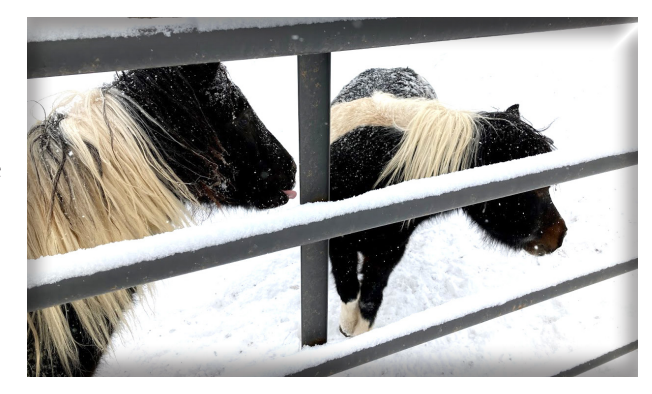
BB and Oreo

Another necessary item that we will need in 2021, when we are able to resume our regular programs, is a new wheelchair ramp. Our old wooden ramp had been rebuilt three times, and this past summer since we were not doing therapeutic riding lessons and the ramp had become too worn out to be really safe, we tore it down. We have a wonderful new ramp picked out, which is on our wish list for next year!